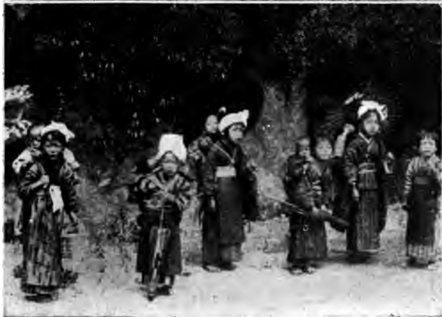
CARRYING FAGOTS BABY-TENDERS